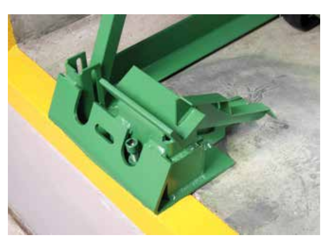
SafeTFrame for greater structural strength & durability