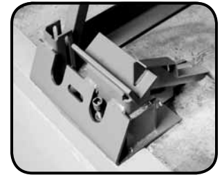
Front SafeTFrame™ Pedestal