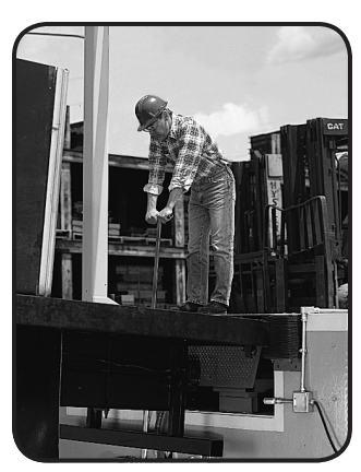
Dock worker uses push bar to activate and release