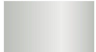
ALUMINUM & INSULATED ALUMINUM