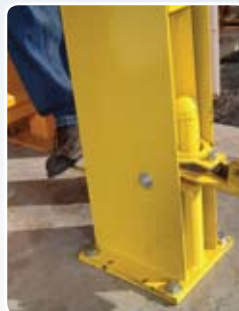
Releasing the foot latch