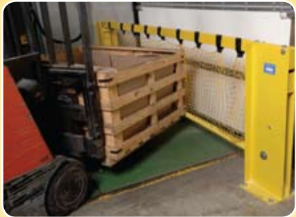
Reduce damage to doors and door tracks