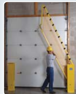
Raising the Dock Impact Barrier