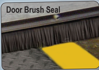
Door Brush Seal