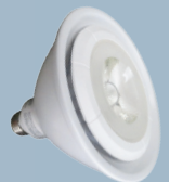
E-Saver 38™ LED Lamp