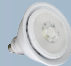
E-Saver 30™ LED Lamp