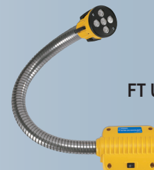
FT Ultra LED™ Dock Light