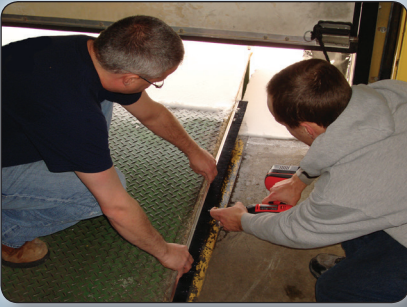
Dock Leveler Brush Seal

APS Dock and Door Weatherseal products can help pass inspections by regulatory authorities. APS products are designed to seal air gaps and control pest infestations.