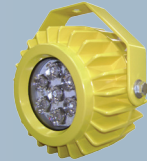
High Impact LED™ Dock Light