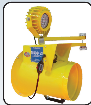
Turbo-ES™ Fan shown with optional High Impact LED Dock Light™