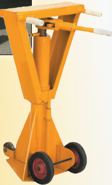
Heavy Duty Ratchet Beam