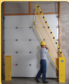
Raising the Dock Impact Barrier