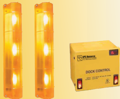
Guide Lights and Control Box