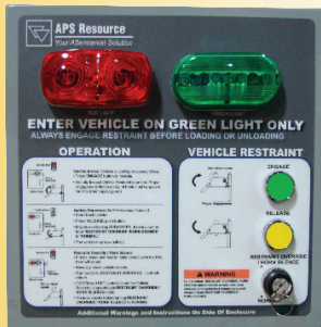
APS 2000 Control Box