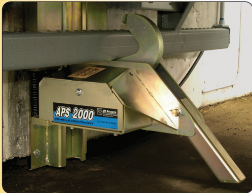
APS 2000 Vehicle Restraint