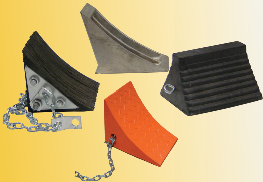
Laminated, Aluminum and Molded Wheel Chocks