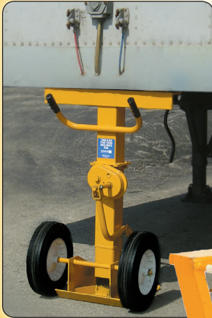
Heavy Duty Hold Safe Stabilizer