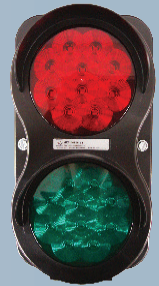
Universal Red and Green LED Lights