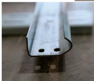
Durable, heavy .063 gauge track