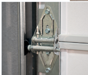
Quality hardware tested to 10,000 cycles