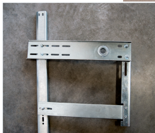
Integrated End Bearing Plate requires no assembly.