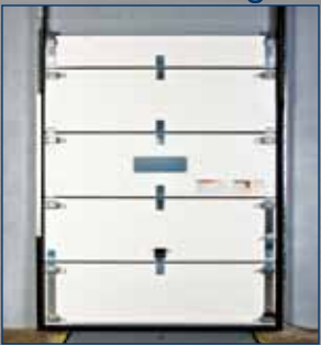
TKO Windload Package