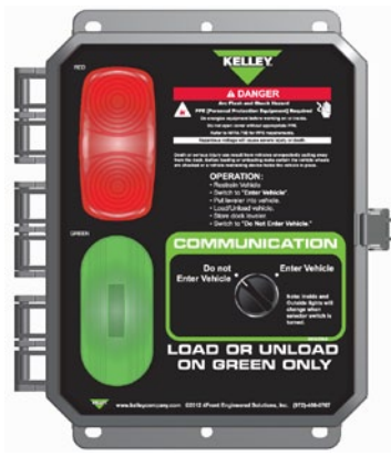
Manual Light System (MLS) Manual Activation