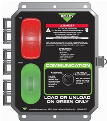
Automatic Light System (ALS) Auto Activation