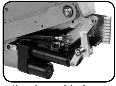
Linear Actuator Drive System

10. Limited Warranty: Kelley warrants all components to be free from defects in material and workmanship, under normal use, for a one year base period from the date of shipment in accordance with Kelley's Standard Warranty Policy. The "Base Warranty Period" will begin on the completion of installation or the sixtieth (60th) day after shipment, whichever is earlier.