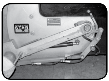
Hydraulic activation system