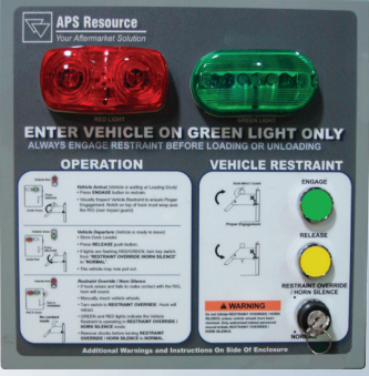
Compact 12"x12" Size Heavy Duty Industrial Control Box